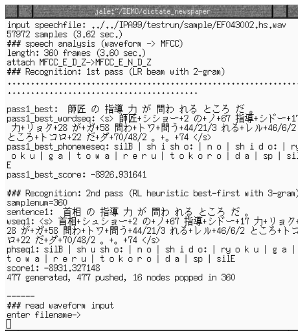
Figure 1: Screen shot of Japanese dictation system using Julius.

We developed a two-pass, real-time, open-source large vocabulary continuous speech recognition engine